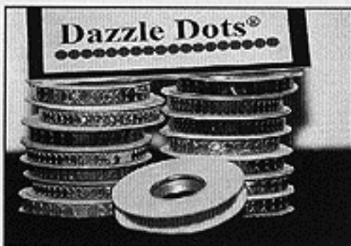
Dazzle Dots, rolls of peel and stick glitter.