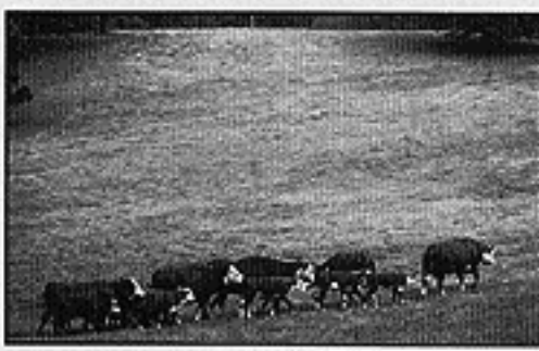
Meadowbrook's herd of Hereford beef cattle.